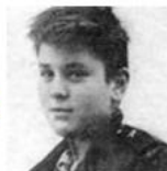
Robert De Niro